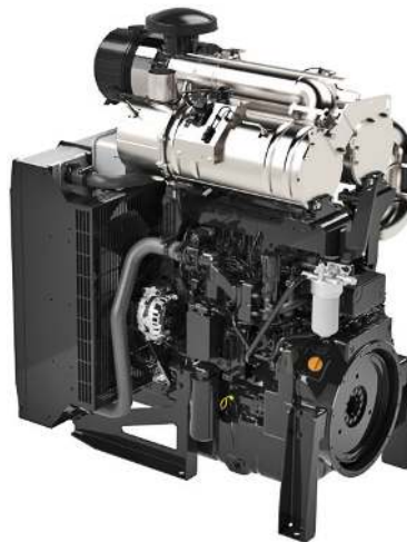
Stationary PTO Unit