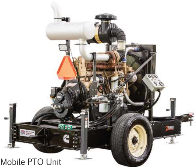
Mobile PTO Unit